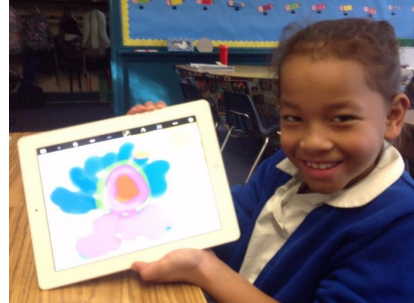
This 3rd grader proudly shows off her digital artwork.